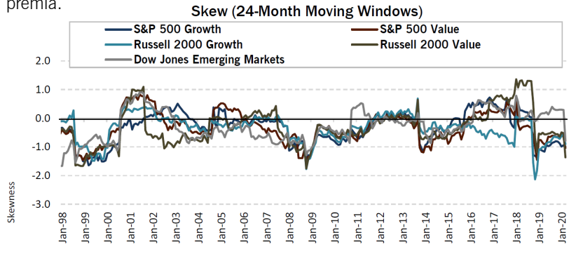
Sources: Zephyr, Redwood, (Redwood, "The Third Moment in Equity Portfolio Theory & SPT" 2020). Data: July 1995 – June 2020. For illustration purposes only.

However, their skew also fluctuates over time about 0 at different points in time, providing opportunity to overweight and underweight to potentially capture risk premia.